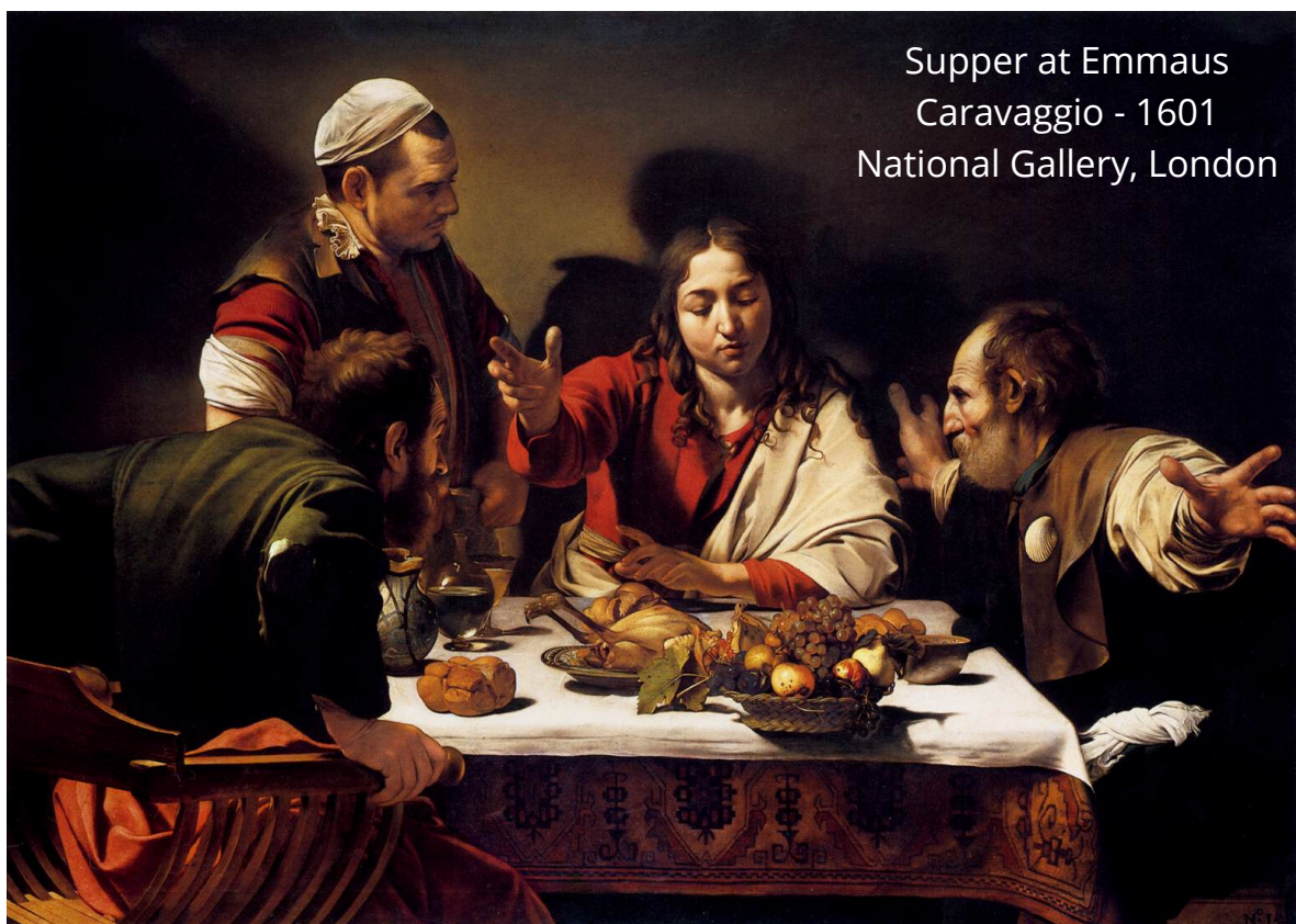
Supper at Emmaus Caravaggio - 1601 National Gallery, London

As they came near the village to which they were going, he walked ahead as if he were going on. But they urged him strongly, saying, ‘Stay with us, because it is almost evening and the day is now nearly over.’ So he went in to stay with them. When he was at the table with them, he took bread, blessed and broke it, and gave it to them. Then their eyes were opened, and they recognized him; and he vanished from their sight. They said to each other, ‘Were not our hearts burning within us while he was talking to us on the road, while he was opening the scriptures to us?’ That same hour they got up and returned to Jerusalem; and they found the eleven and their companions gathered together. They were saying, ‘The Lord has risen indeed, and he has appeared to Simon!’ Then they told what had happened on the road, and how he had been made known to them in the breaking of the bread.